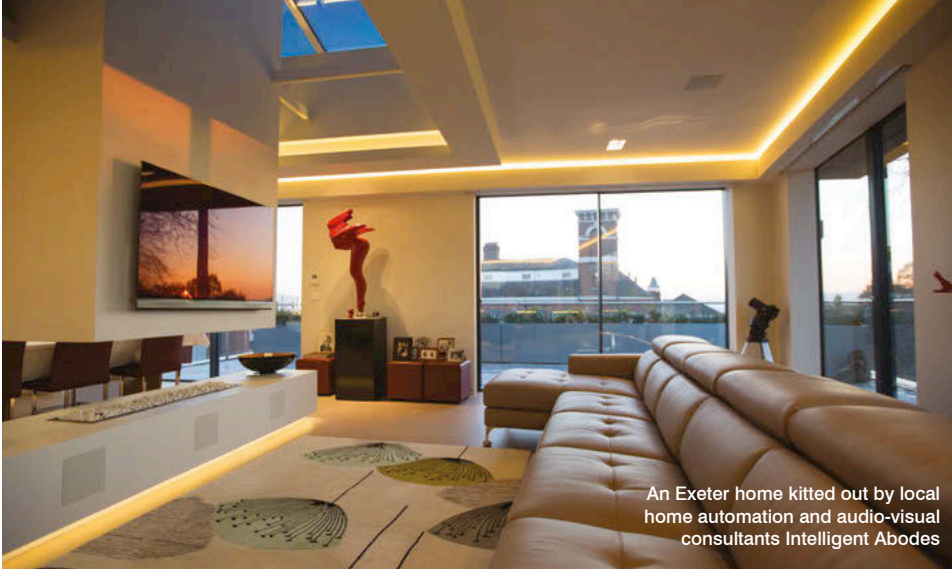
An Exeter home kitted out by local home automation and audio-visual consultants Intelligent Abodes